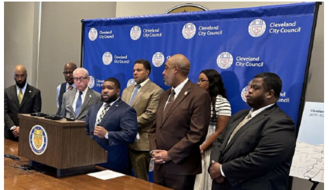
Cleveland City Council unanimously passed a resolution declaring gun violence a public health crisis in the city.

According to the Centers for Disease Control and Prevention (CDC), 1,768