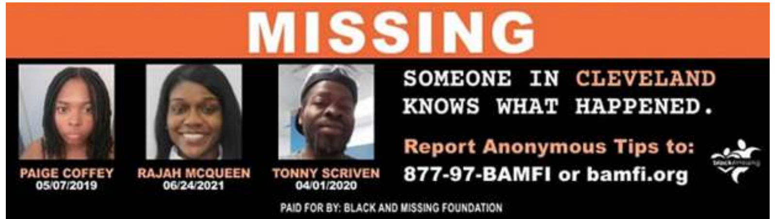
In 2023, the Black and Missing Foundation posted this billboard in Cleveland as part of a multi-city campaign to raise awareness of missing persons of color.

In 2012, the Division of Police issued a general police order requiring the Division to comply with the Ohio Revised Code on