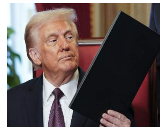
President Donald Trump holds an executive order.

to produce more energy in the U.S. by leaving the Paris Climate Agreement and changing rules about oil and gas. Producing more energy in the U.S. might make energy cheaper for now, but it could also cause more pollution and harm the environment in the future.